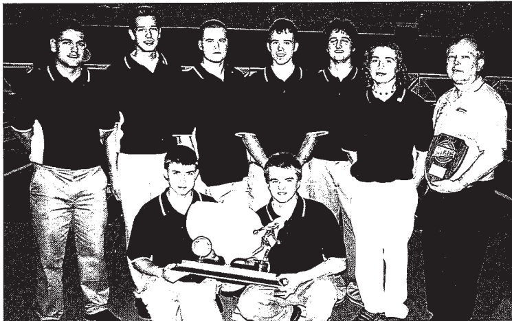
2008 Men's Bowling Champions Vincennes University